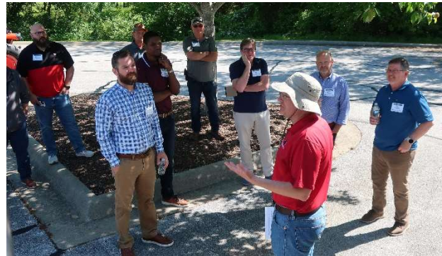
Figure 2 – Emulsion manufacturing trailer tour and manufacturing demonstration

After a session on asphalt emulsion quality control and testing, and lunch, specifications and inspection were covered in the classroom. After a break, the audience moved outside again for the live chip seal and slurry seal demonstrations. The day before, a slurry seal and chip seal section had been placed, so the audience could see the treatments immediately after placement and 24-hours after placement. When placed, the sections were brown, but over time cured to black. The chip seals leveraged a CRS-2 emulsion with a local 3/8" aggregate chip, and the slurry seals were a CQS-1H with a local fine aggregate. The CRS-2 and CQS-1H emulsions used in the four sections were manufactured in the previous week at the University of Arkansas. Figure 3 shows the sections being placed. After the demonstrations, there was a brief wrap up and the DoT ended at 3:30 pm.