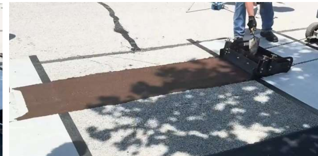
Figure 3 – Chip seal application (top), slurry seal application (bottom). Note that each treatment type has a section placed the day before that was fully cured in the foreground.