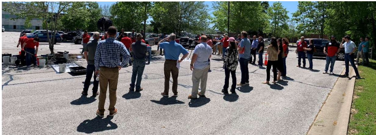
Figure 1 – Demonstration audience